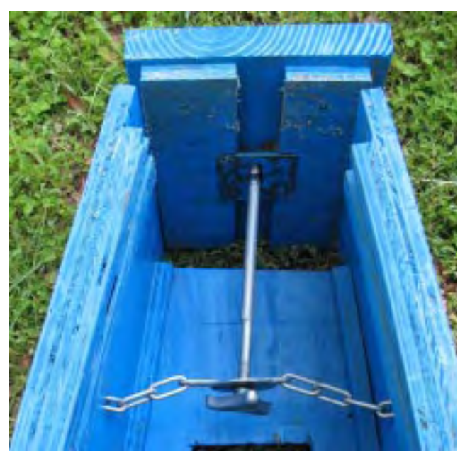
Figure 12: Anvil stand internal view

The concept behind all of this is convenience -- when it's teaching time, just hitch and go. At the site, other folks can help deploy the materials and then switch the unit back to travel mode at the end of the event. Drive home, park it, and go looking for a beer -- sure beats dragging everything from storage, dumping it into a trailer, dragging it out at the event, dumping it back into the trailer when the event is over, then (at home) dragging it all back to storage.