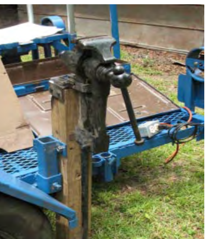
Figure 5: Post vise mount system