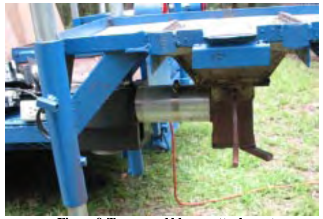
Figure 9: Tuyere and blower attachment

working on a Mark I design (see Pg.9) because I have the sheet of 3/4" ply that used to be the floor of the trailer before its reincarnation. There are also three-leg pipe and chain designs that I might try if I can get some cheap pipe.