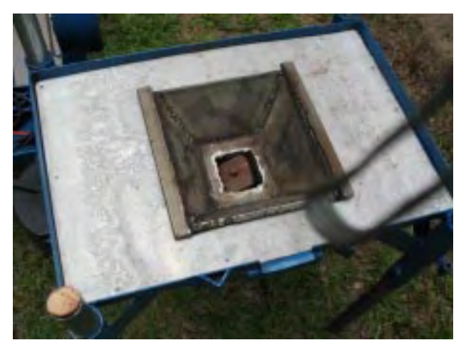
Figure 8: Forge pot & clinker breaker

What is still in the works are break down or portable anvil stands. What we have (and shown in the initial figures) will work and can be transported but eat up a lot of space. I'm