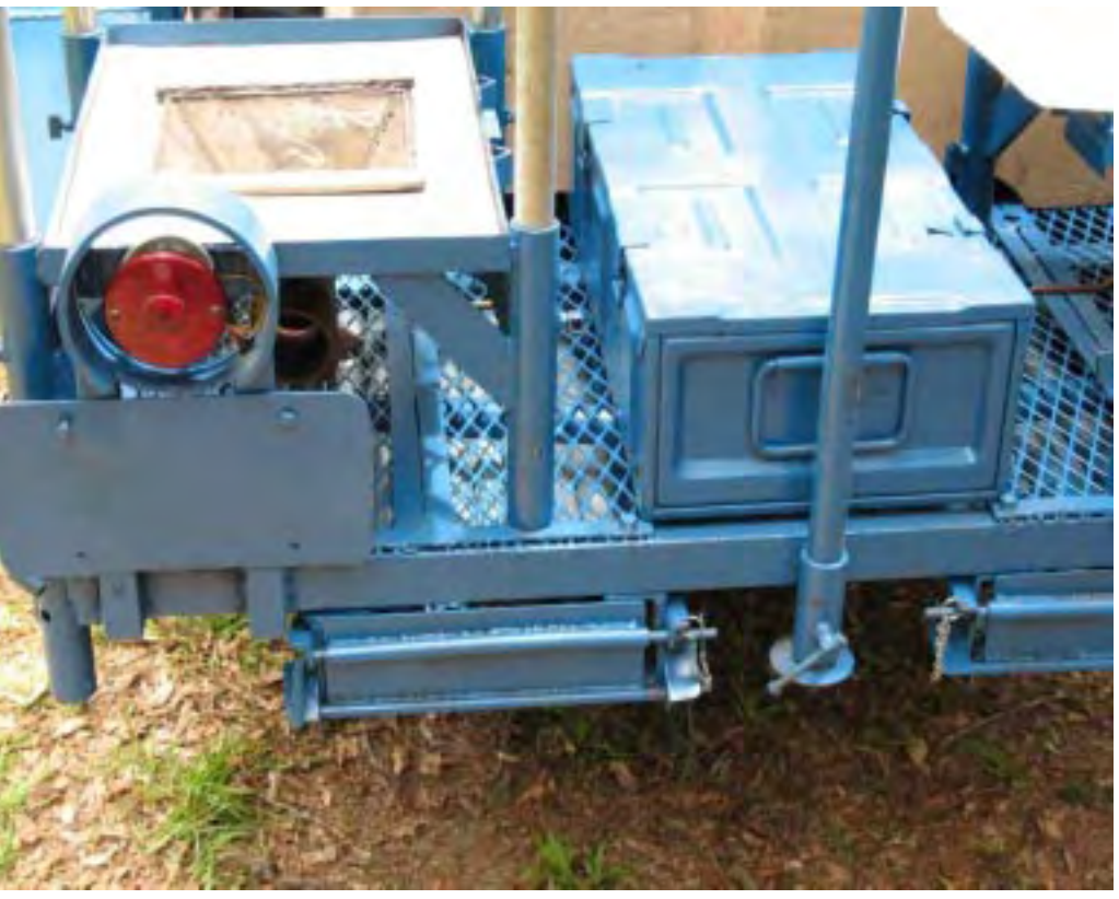
Figure 4: Trailer rear showing baskets, rear leg, and lights.

material). Each socket is provided with a 3/8" lock point (welded nut with a bolt that can be tightened without tools). The pipe used for the sockets is Sch.40 1.25" black pipe that happens to nicely sleeve 1 3/8" thin wall top rail (from chainlink fences). The legs are 32" sections of top rail with a 6" wooden dowel driven into each end (to keep the lock points from crushing the legs). In travel mode, the forges sit slightly off the trailer bed and rest on a