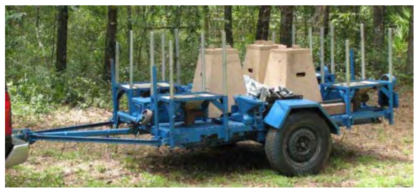
Figure 1: The teaching trailer as of August 2008

bits and pieces. I acquired a couple of large ammo boxes as well as four 110v blowers from the Surplus Center (Lincoln, Nebraska). I also acquired two slabs of stainless steel (6" x 96" x 3/8" and 5" x 96" x 1/4") from the Pioneer Settlement courtesy of the fine scrounging talents of Lester Hollenbeck. Through the good graces of Bill Robertson, we already had a 10' x 20' temporary carport and a pair of 4" post vises. Now all I had to do was assemble it all.