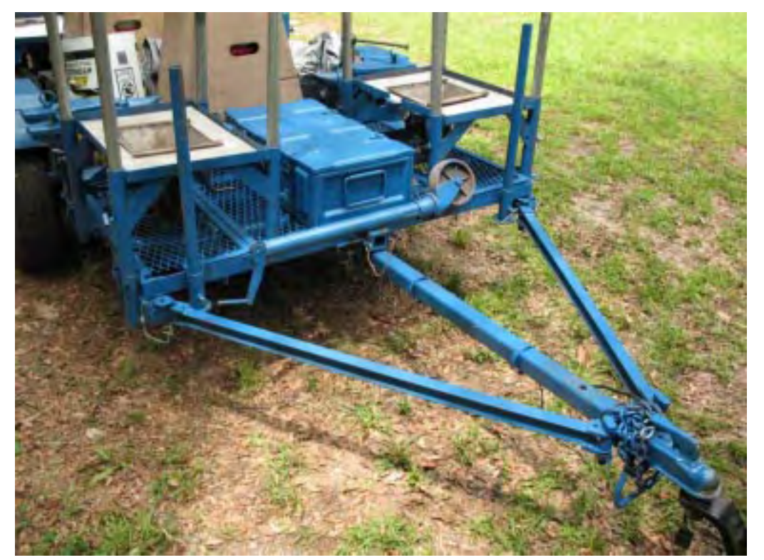
Figure 3: The hitch assembly

welded to the frame. The frame sockets have a light rod welded in place at their bottom ends. The legs run through the forge sockets and into frame sockets. When the lock points on the four sockets (two on the forge, two on the frame sockets) are tightened, the forge cannot go for a walk by itself. The other two legs simply sleeve into the remaining forge sockets and are locked in