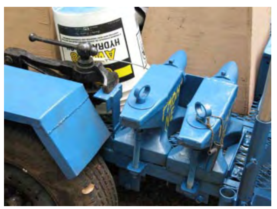
Figure 6: Anvil stalls and vise mounts

cluding shipping). They are equipped with an adapter that