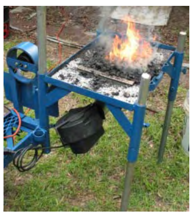
Figure 10: Forge with copier blower

Those internal legs also offer a another nice opportunity. The trampoline had right angle brackets that easily sleeve over the legs. A carefully measured piece of leftover trampoline pipe and a pair of the brackets make a handy bridge across a pair of the internal legs (say the front placed internal pair of the rear forges and the rear-placed internal pair of the