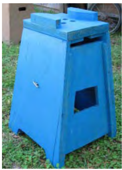
Figure 14: Anvil stand assembled

knob is turned to pull the slack out of the chains and to pull the top down onto the sides. Voila - a breakdown anvil sand (Fig, 14). We'll test it at the conference.