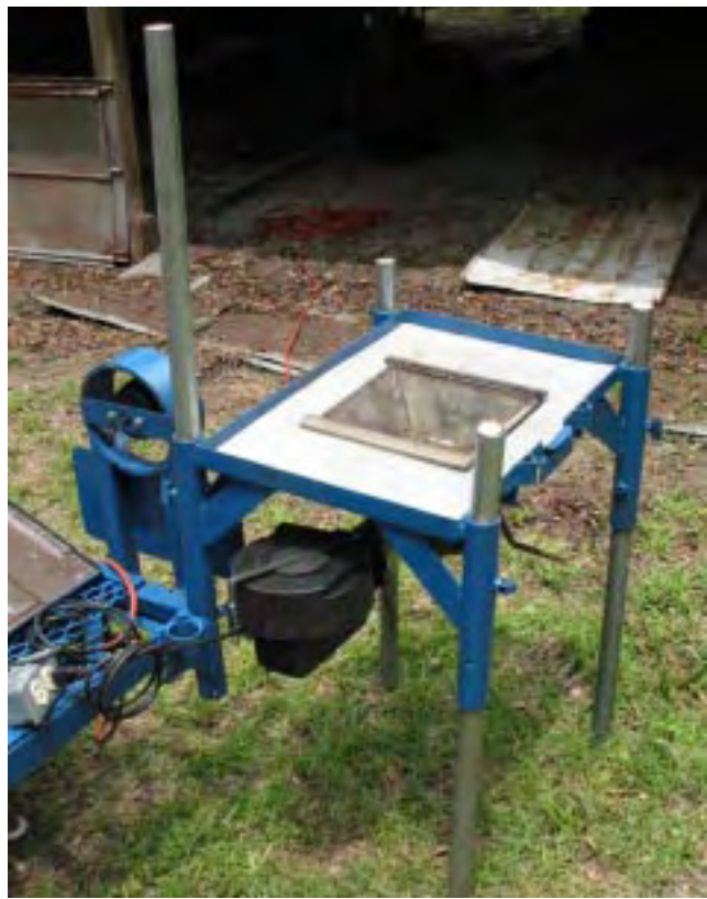
Figure 7: Forge deployed for use

funnels the output into a 2" to 3" section of 3" pipe and have a slide plate and control lever that cuts off air to the blower hence air control. Both of these blowers have independent air supplies to the motors, so overheating ought not to be a problem. The blowers mount to the forges with a sleeve of commercial vent pipe and a couple of radiator clamps.